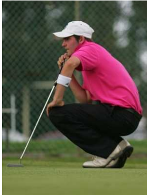
Sahalee Players Championships Nth West Pacific Amateur Pacific Coast Amateur