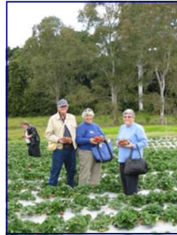
Carer Social group at the Strawberry Farm in 2009

Monday, 18th January/ Monday, 15th February/ Monday, 15th March Monday, 19th April/ Monday, 17th May/ Monday, 21st June Monday, 19th July/ Monday, 16th August/ Monday, 20th Sept. Monday, 18th October/ Monday, 15th Nov./ Monday, 20th Dec.