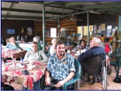
Carer Social group at Lyell Deer Farm in 2009